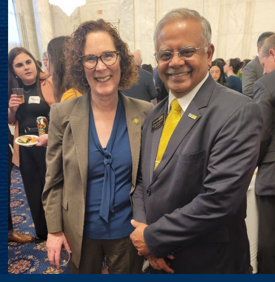
With Congresswoman Val Hoyle (3/22/23)