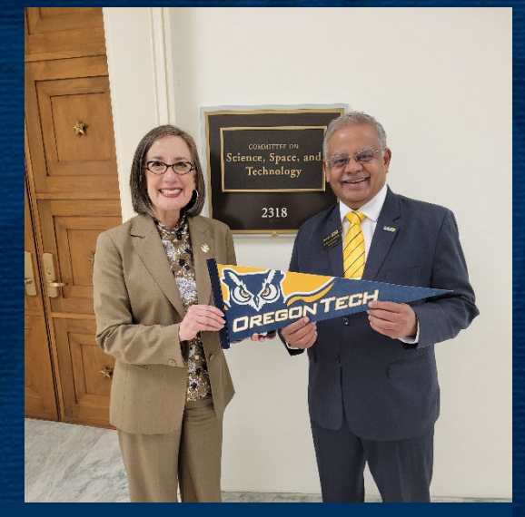
With Congresswoman Salinas (3/23/23)