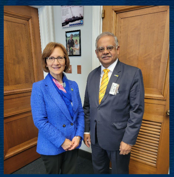
With Congresswoman Bonamici (3/23/23)