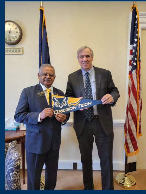
With Senator Merkley March 23, 2023